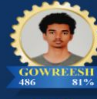
GOWREESH 486 81%