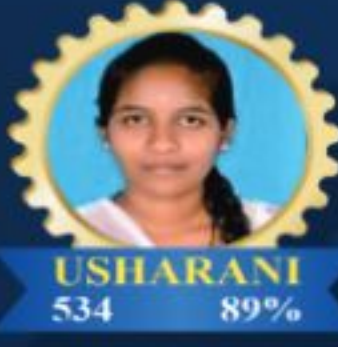
USHARANI 534 89%