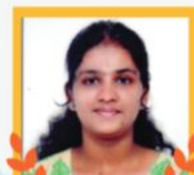
SUBHASRI 558 93%

#23/C, Sector 'A', Yelahanka New Town, Bengaluru-560 064 Phone: 080-2856 6399, 2856 6099, Mob: 9513566399 E-mail: bcapm2007@gmail.com web: www.bcapm.org Enquiry: 9:30 to 3:30