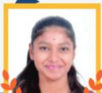
SHWETHA H 494 82%